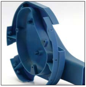
Aerodynamic and functional parts produced with Bluestone SL material. Image (right) courtesy of the Renault F1 Team.